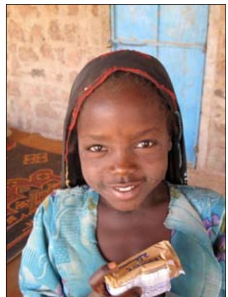
A Darfuri girl, living in a Chad refugee camp, enjoys a biscuit. (Sondra Crosby, MD)