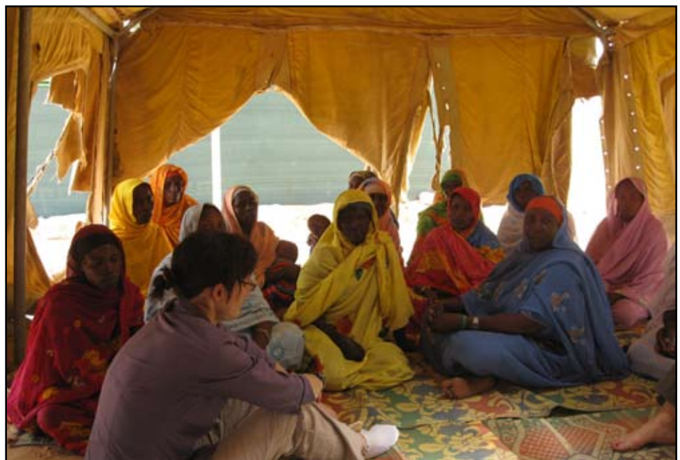
PHR team members meet with sheikas (female camp leaders) at the Farchana camp, Chad, to explain the purpose and methods of a sexual violence study.

Our report garnered extensive media coverage and is being used to advocate for more effective protection of and support for these women and girls, and to press for prosecution of perpetrators in Chad and Sudan. And hundreds of people from dozens of countries visited DarfuriWomen.org to send messages of comfort and hope.