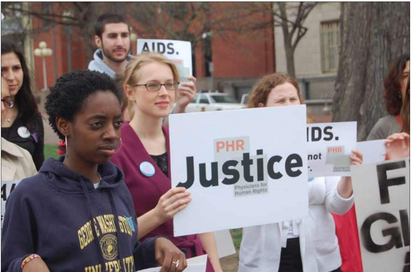
Students rally in Washington, DC in April 2009 to call on Congress to re-authorize global AIDS funding.

When we shine a light on human suffering — when we stop torture, end neglect, discover and document mass graves, work to prevent atrocities such as genocide and rape as a weapon of war and support health systems that are accountable to the most vulnerable people — we kindle a vision of a world where every person can fulfill his or her potential in dignity and freedom. And we help make that vision a reality.