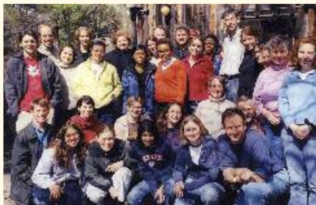
PHR staff at Essex Conference and Retreat Center