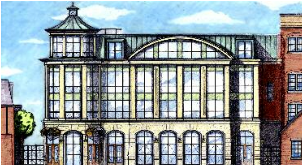
New offices in Cambridge, MA which PHR shares with the Zero Arrow Theatre and the Carr Foundation